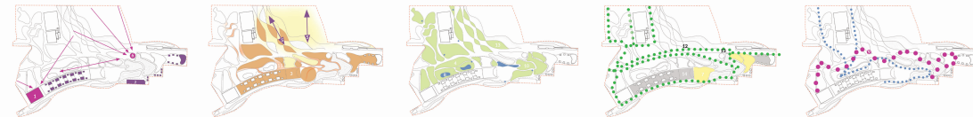
ATTRACTION POINTS AND FUNCTION RELOCATION BEACH CONNECTION SHADING / ROOFING PROVISION CHANGE OF PATHWAYS MATERIALS LESS CONCRETE, MORE GREENERY BIODIVERSITY COOLING POINTS, WATER DRINKING POINTS HABITAT FOR ANIMALS PARKINGS INTO SPORTS AREAS MIXED USE SPACE ORGANISATION ROAD REORGANISATION WOONERF EDUCATIONAL INFO PATHS - HISTORY OF THE MARINA - BIODIVERSITY IN THE MARINA

1, 6, 2 5, 3, 11 4, 10, 8, 14 7, 15, 12, 13 9